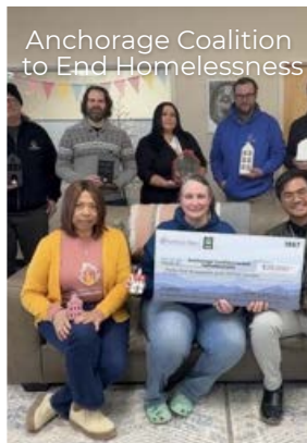
Anchorage Coalition to End Homelessness