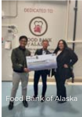
Food Bank of Alaska

Mark your calendars and join us on May 2 nd at the Anchorage Golf Course as we come together to raise awareness and support for individuals and families affected by Alzheimer's disease and related dementias.