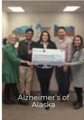
Alzheimer's of Alaska