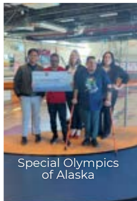
Special Olympics of Alaska