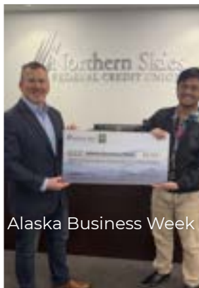
Alaska Business Week